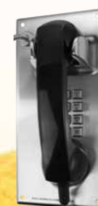
Compact CST W130 X H270