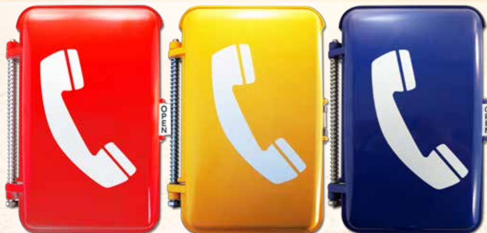
FIRE RED GENERAL INDUSTRIAL YELLOW BLUE

There is an enclosure to suit any product in the Dallas Delta standard range. The Sentry , the Sentinel and the compact sized CST are all (W130mm x H270mm). The enclosures below are designed to fit these product ranges