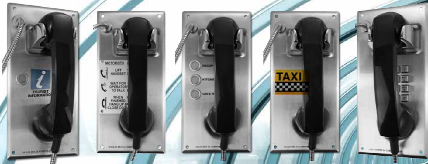
Standard sizes includes - W130mm x H270mm and W233mm X H322mm (custom sizes available) Choose from keypad , custom buttons to a no button handset or loud-speaker options. Custom screen printing, engraving & labelling on panel available.